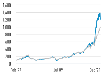
Performance of 100 USD Invested Since Inception (Cash Value)

— Class A Shares — Russell 1000 Growth Net 30% Withholding Tax TR Index