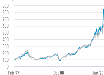
Performance of 100 USD Invested Since Inception (Cash Value)

— Class A Shares — Russell 1000 Growth Net 30% Withholding Tax TR Index